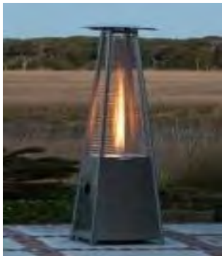
Stainless Steel Pyramid Patio Heater by