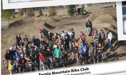
Fernie Mountain Bike Club Fernie Mountain Bike Skills Progression Park