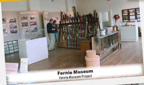
Fernie Museum Fernie Museum Project