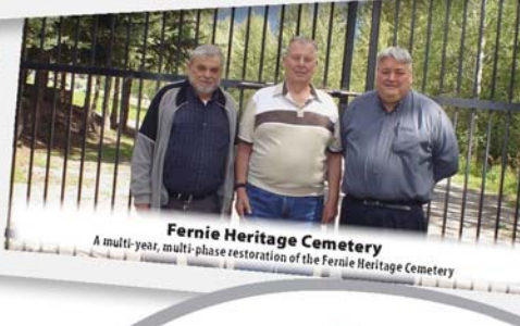
Fernie Heritage Cemetery A multi-year, multi-phase restoration of the Fernie Heritage Cemetery

All Members! Cast your vote in both Fernie and Elkford April 8-9 (Elkford projects are voted on in Elkford, Fernie projects in Fernie)