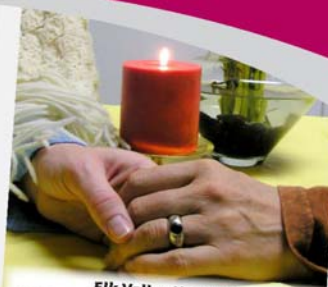
Elk Valley Hospice Palliative Care Equipment - Grief Circle Companionship Session