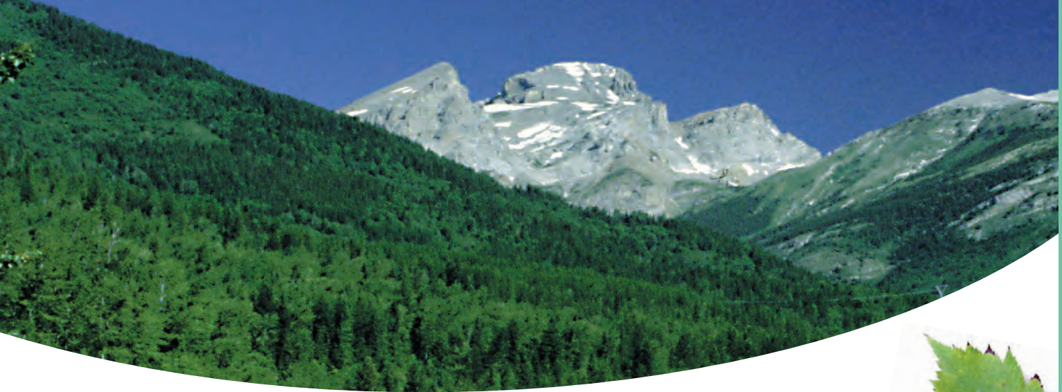
Three Sisters in Fernie, BC