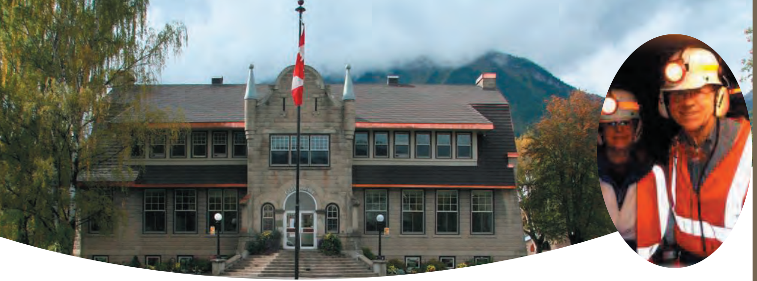
City Hall and former Coal Company office

“If it wasn’t for mining, Fernie wouldn’t be here.” The Miners Walk Exhibit Steering Committee September, 2010